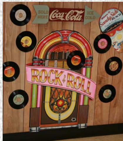
"Running with the Devils" Rock & Roll theme décor inside the Blue Devil Den

A perfect score from the State means that more students are eating healthy meals on a daily basis, and CISD is doing their part to make it possible. Please join the Celeste ISD Superintendent and Board of Trustees in thanking these ladies for their contribution to the well-being of our students and staff.