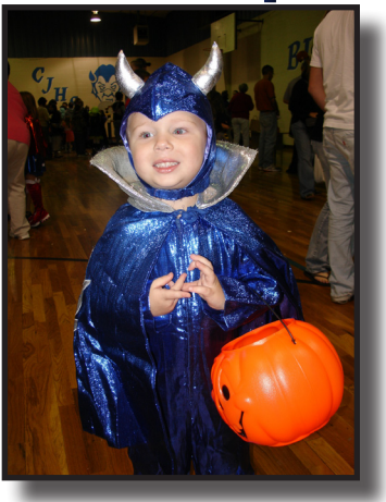
CISD students and community of all ages enjoyed the annual Fall Festival, which once again, was a success!