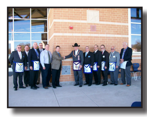
The Grand Masons' Lodge conducted the Cornerstone Dedication Ceremony this fall.