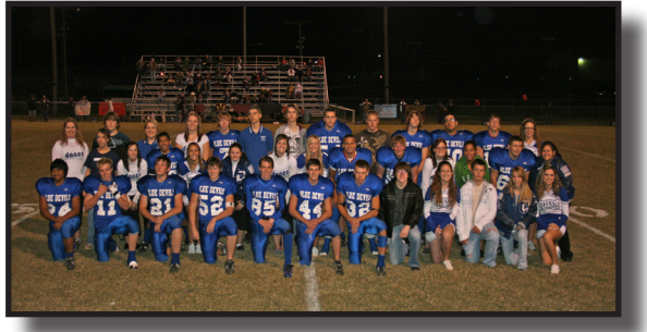
Celeste High School's Senior Class of 2010 gathered for a group picture at the last home football game of the season.