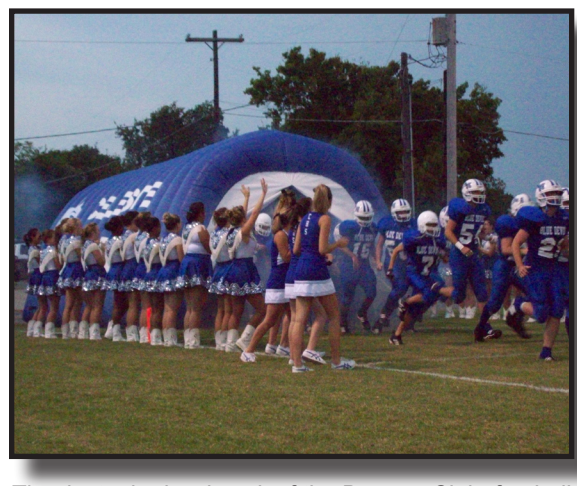
Thanks to the hard work of the Booster Club, football players, cheerleaders and the community, the 2009 Celeste Blue Devils make a bold entrance on the field with the new Blue Devil tunnel.